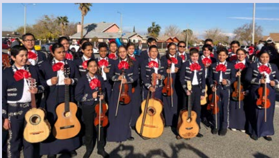
MARIACHI GROUP OF LOS AMIGOS

Los Amigos Dual Immersion with STEAM emphasis prides itself on being one of the highest performing K-8 schools in the Palmdale School District. The implementation of a Dual Language program is proof that learning two languages provides students with the skills needed to achieve and be successful not through high school, but beyond. Knowing two languages will provide students with more future opportunities. We are also WASC certified. Los Amigos also has a STEAM emphasis, which provides our students with many other opportunities including Robotics, Project Lead the Way and Mariachi. Our Biliteracy Program provides students with the opportunity to attain the Pathway to Biliteracy award. We also have an award winning ASB club, sports programs, which include, volleyball, basketball and soccer. Go Dragons!